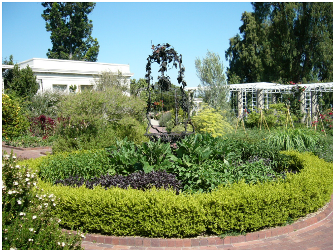
Across the Garden to the Tea Room (6/29/2014)