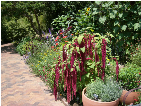
Cut Flower Bed (6/27/2014)