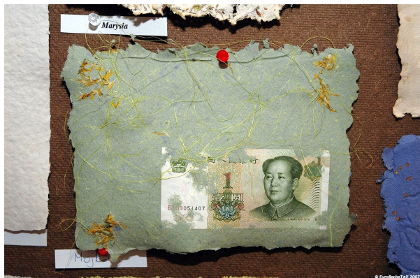
Handmade paper projects

fire; replete with food, drinks, songs, and of course fire-breathing pyro \text{T}_{\text{E}}\text{X} nics.