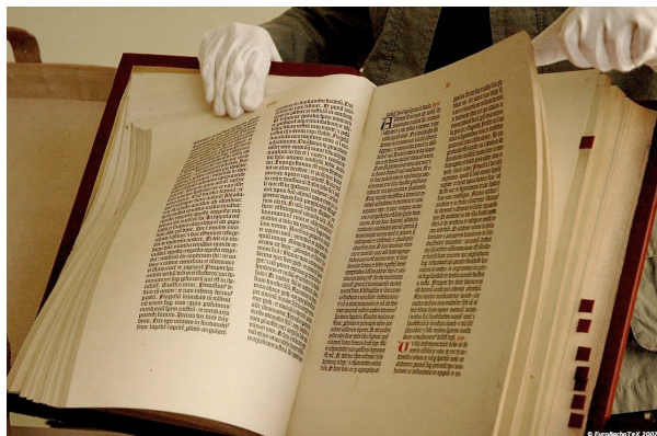
Gutenberg Bible exemplar at the Copernican Library

expansion) that Gutenberg used to achieve aesthetic interline spacing.